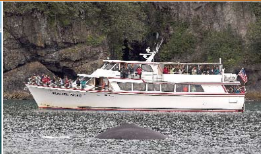
Columbia Glacier Cruise