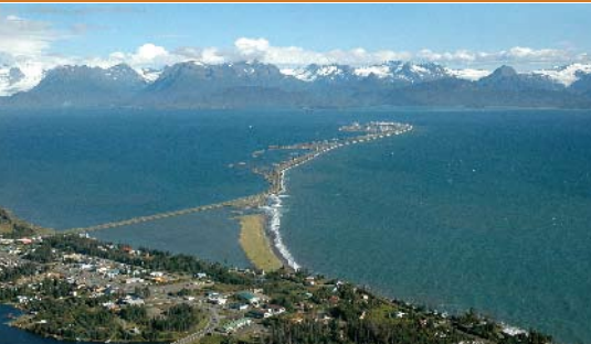
Homer Spit Aerial View