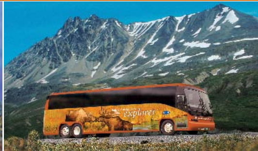
Exclusive Explorer® Motor Coach