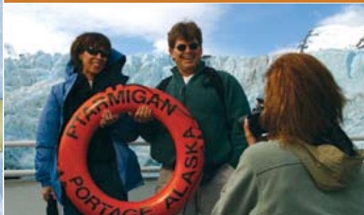
Portage Glacier Cruise