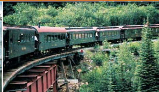
White Pass & Yukon Railroad