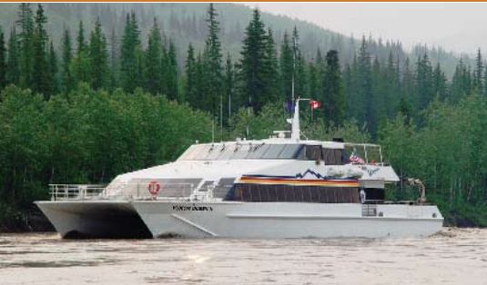
m/v Yukon Queen II