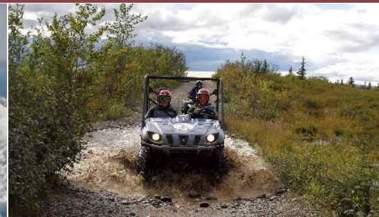
Stampede Trail ATV Adventure