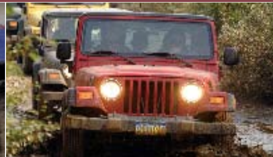
Denali Jeep Backcountry Safari