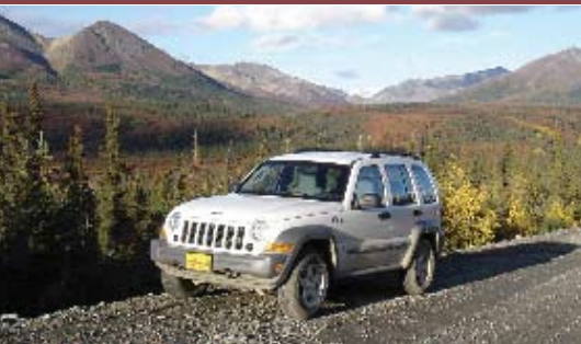
Denali Self-Drive Jeep Tour