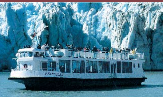
m/v Ptarmigan on Portage Lake