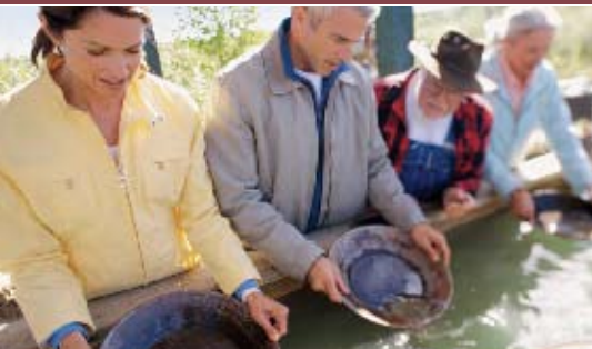
Panning for Gold