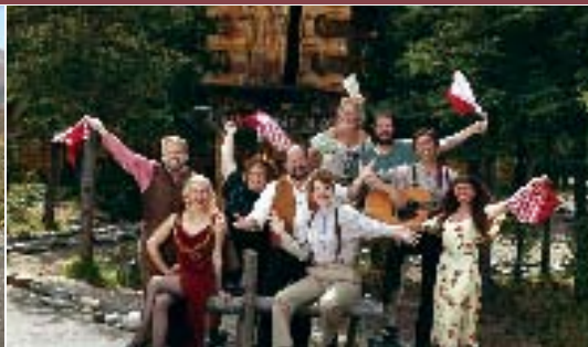
Cabin Nite Dinner Theater