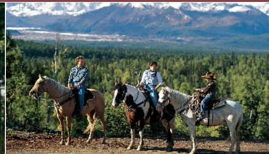
Guided Horseback Tours