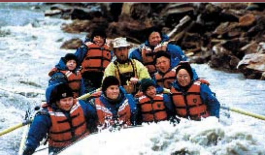
Rafting in Denali