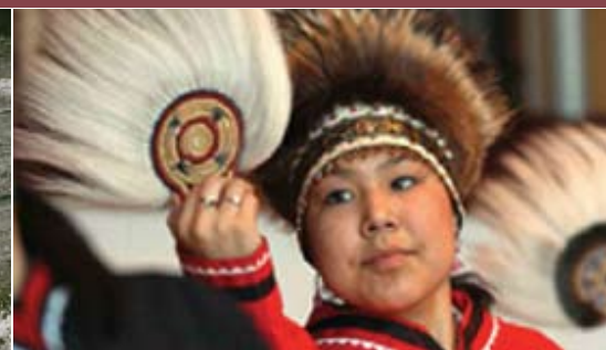
Alaska Native Heritage Center Dancer