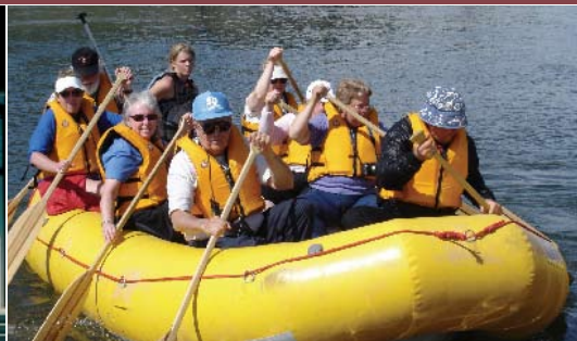
Rafting on the Klondike River