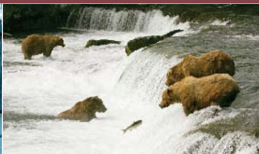
World-Famous Bear Viewing