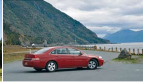
Traveling By Car In Alaska