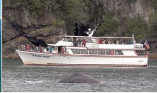
Columbia Glacier Cruise