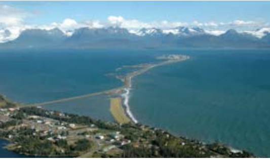
Homer Spit Aerial View