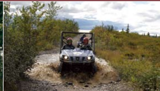
Stampepe Trail ATV Adventure