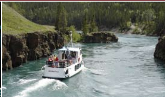
mv Schwatka River Cruise