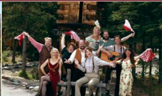
Cabin Nite Dinner Theater