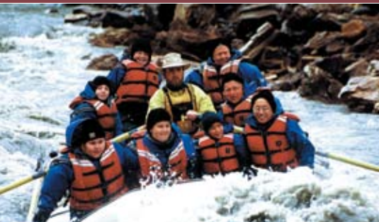
Rafting in Denali