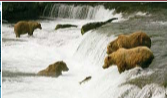
World-Famous Bear Viewing