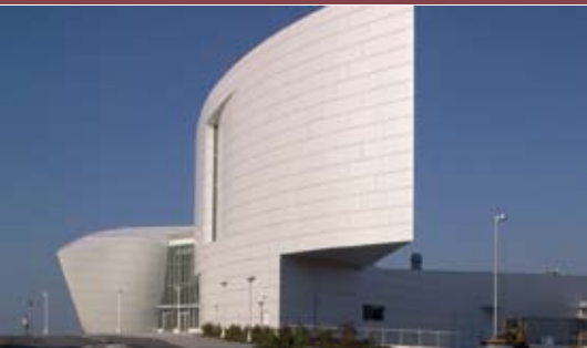
Museum of the North