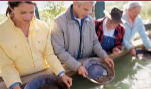
Panning for Gold