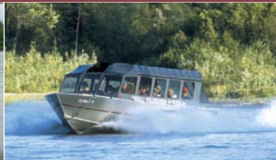
Susitna River Jet Boat Tour