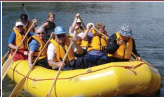
Rafting on the Klondike River