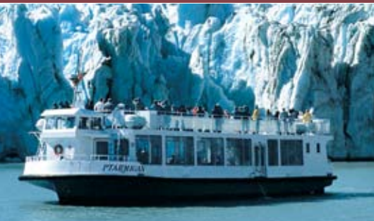
mv Ptarmigan on Portage Lake