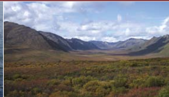
Scenic Tombstone Park