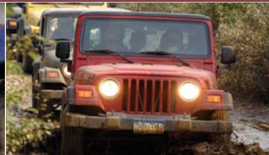
Denali Jeep Backcountry Safari