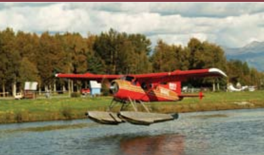
Spectacular Seaplane Flightseeing