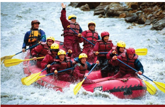
Raft the Nenana River in Denali.