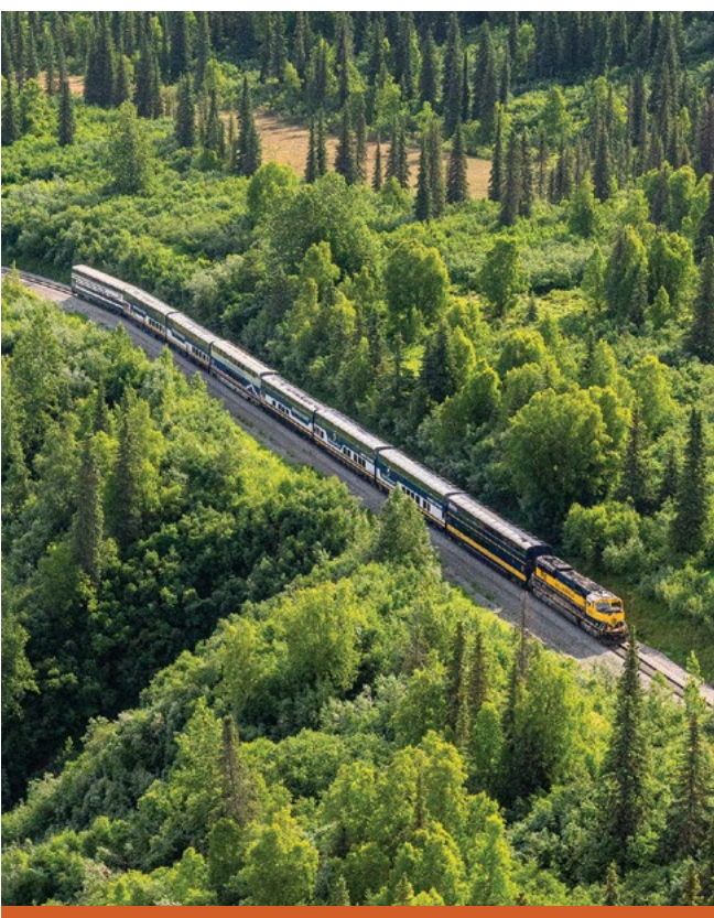
The most scenic way to travel in Alaska is by railcar.