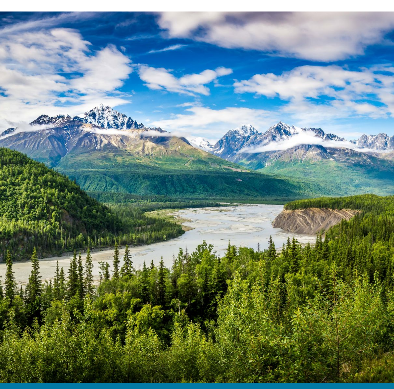
Denali Rail Tours · Multi-Day Packages · Sightseeing Excursions