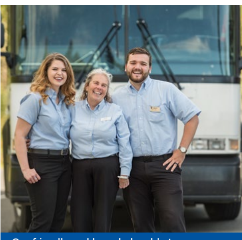
Our friendly and knowledgeable team.