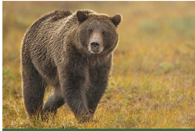
Grizzly bear in Denali National Park & Preserve.