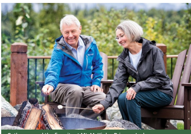
Gather around the fire pits at Mt. McKinley Princess Lodge.