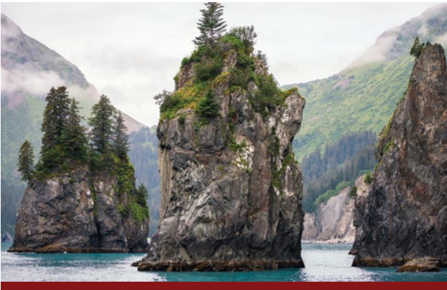
Kenai Fjords National Park