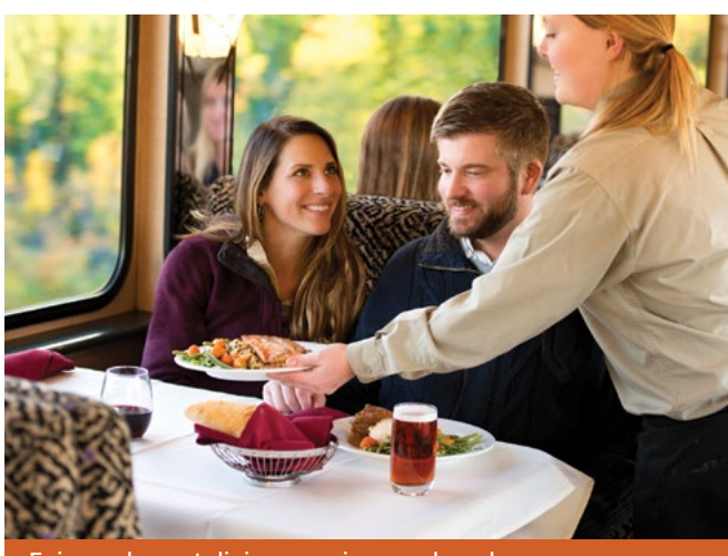
Enjoy a pleasant dining experience onboard.

Rail transportation between Anchorage and Denali operated by Gray Line Alaska on McKinley Explorer or Princess Rail service. Rail transportation between Fairbanks and Denali operated by Alaska Railroad.