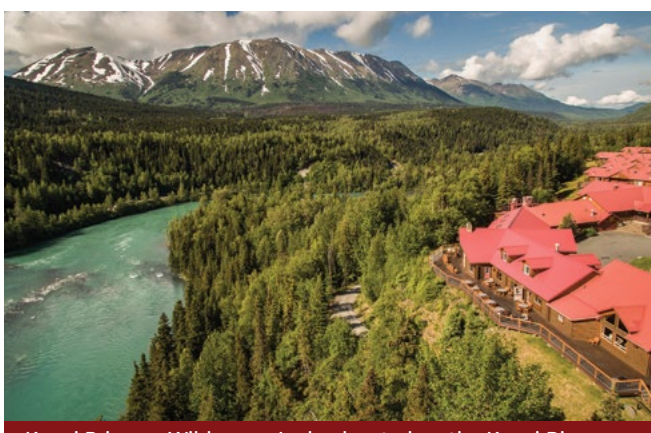
Kenai Princess Wilderness Lodge located on the Kenai River.