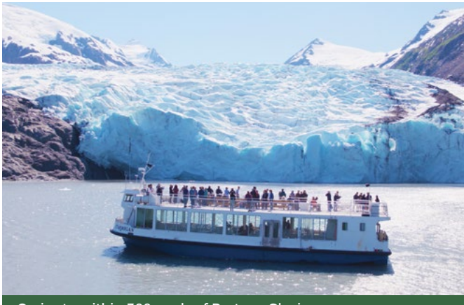
Cruise to within 300 yards of Portage Glacier.